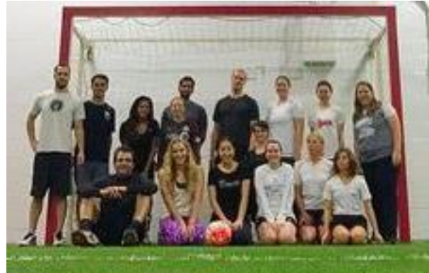
MacOrtho Research Team registered the most steps over the five day challenge

Congratulations and thanks to all walkers on demonstrating the value of mobility, and raising funds to enhance the bone and joint health of Canadians.