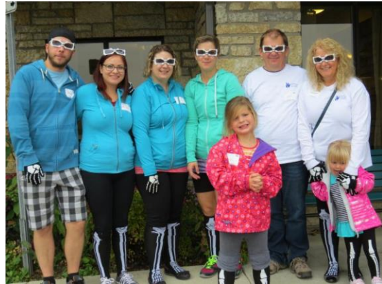
Team Hip to be Square

The COF also extends heartfelt congratulations and thanks to all the volunteers, surgeons, patients and their families who contributed to the success of this year's event. Our collective efforts advance the COF's mission to improve bone and joint health in communities across the nation.